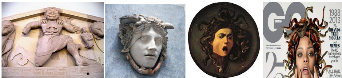
Medusa, Temple of Artemis, ca. 580 B. C., Archaeological Museum of Corfu; Phidias, Medusa Rondanini, 440 B. C., Glyptothek, Munich; Caravaggio, Head of Medusa, ca. 1996–98, Galleria degli Uffizi, Florence; Damien Hirst, Rihanna and Medusa, GQ Cover.